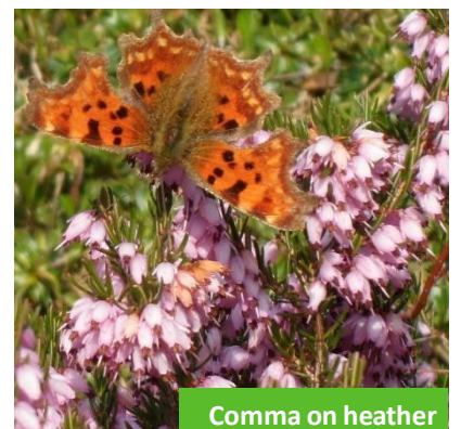
Comma on heather