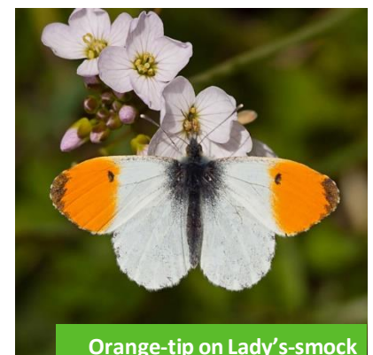
Orange-tip on Lady's-smock