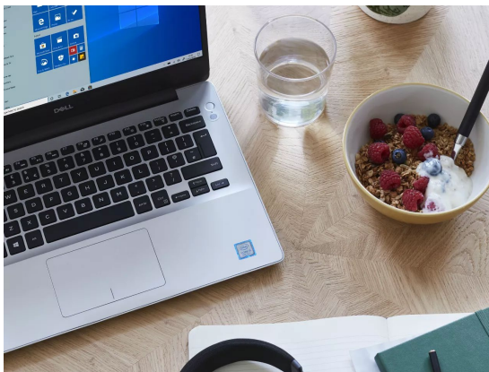
Healthy balanced work life ^

We have seen something very similar to this before and yet nobody is making the comparison. Back when the public viewed covid as a threat, People were petrified to put themselves at risk