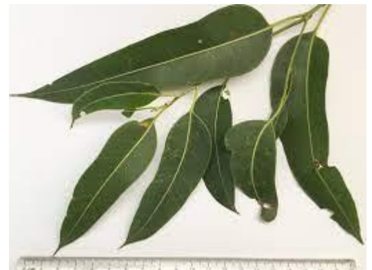
Eucalyptus punctata - adult leaves

It is possible to buy eucalyptus oil or olbus oil, so that you can smell what a koala's food smells like.