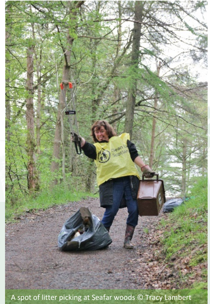
A spot of litter picking at Seafar woods