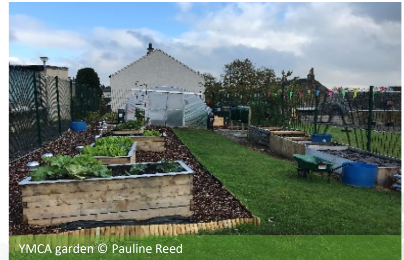
YMCA garden

There are plans in place to make the roadsides welcoming with designs including a wooden caterpillar (see overleaf) and metal welcome sign and have a blacksmith who is happy to work with the group.