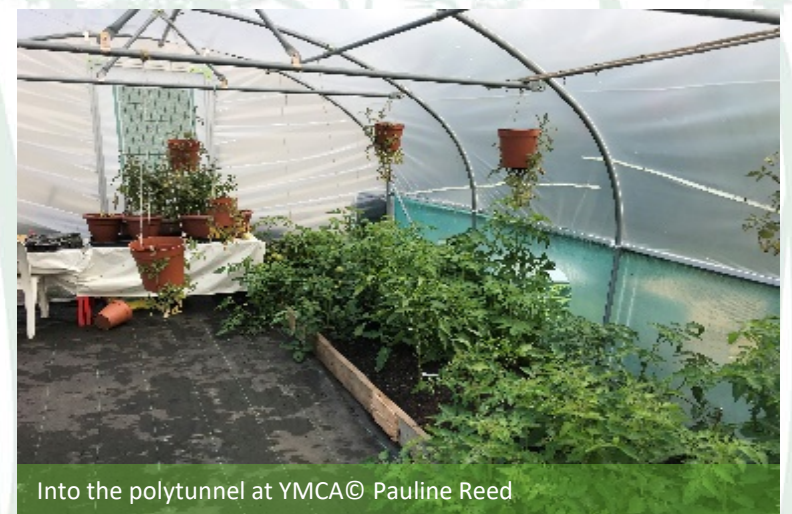
Into the polytunnel at YMCA