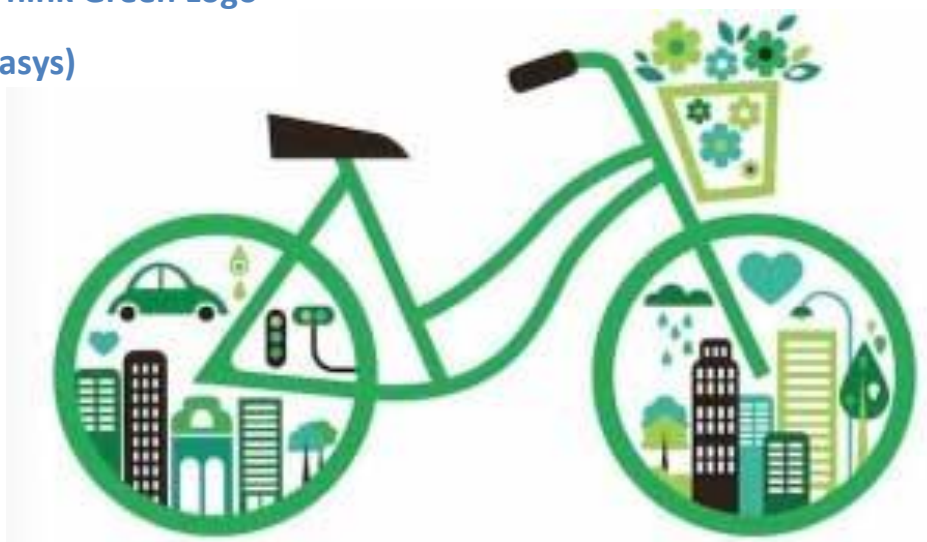
Picture 7 - Cycle Don't Drive Logo (From We Hate to Waste)