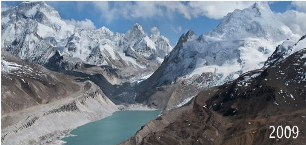
Picture 3 - How Glaciers Have Melted Because Of Global Warming

Climate change is mostly being caused by people polluting the air with greenhouse gasses. This is heating up the planet, melting all the ice caps and glaciers. In the future there might be no glaciers at all!