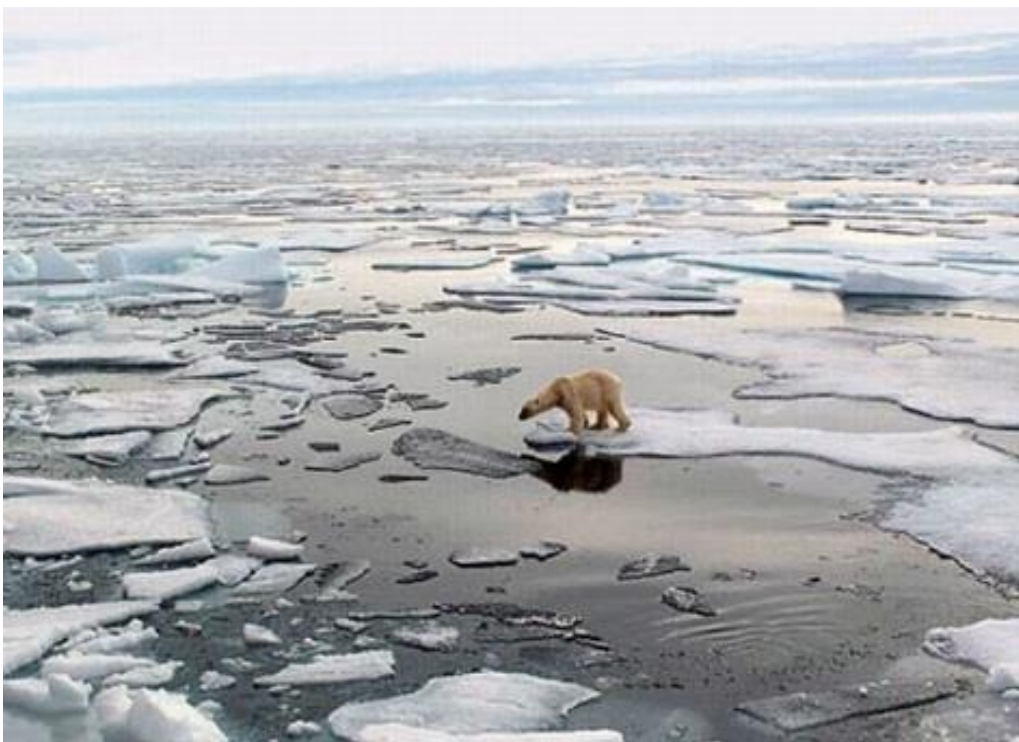
Picture 1 - A Polar Bear Walking Across Melted Ice Caps

Most climate scientists agree the main reason for the ice caps melting is global warming. The dark oceans absorb a lot of this heat. This warms up the water and melts the arctic ice floating on top of the water. This has sped up sea level rise around the world. Melting ice from both poles has been responsible for a fifth of the global rise in sea levels since 1992. The polar ice caps have melted faster in the last 20 years than in the last 10,000.