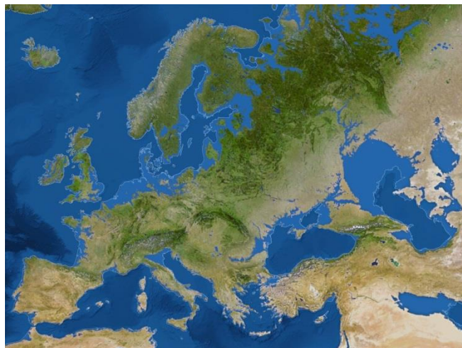
Picture 2 - The Earth after Sea Level Rise.

Sea levels will rise which could submerge lowland cities. There would be constant heat waves and the ice on the Arctic and Antarctic would melt which would leave poor penguins and polar bears without a home possibly making all wild Arctic species extinct.