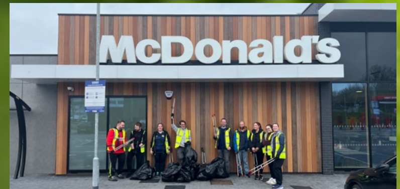
A litter pick by McDonald's during Spring Clean