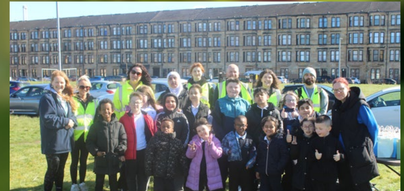
A litter pick with Wheatley Group and a local school in Govan