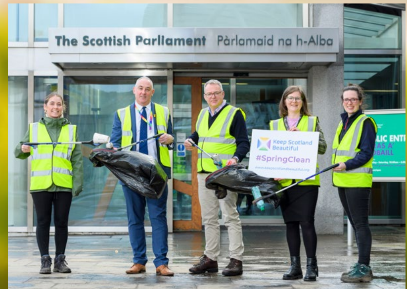
Launching #SpringCleanScotland at The Scottish Parliament