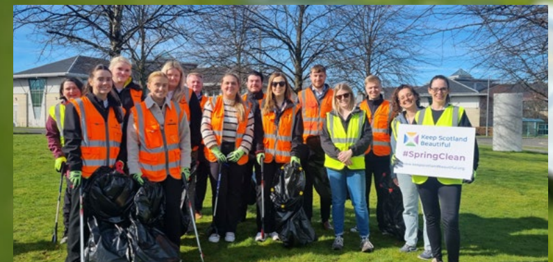
A litter pick with Robertson Group during Spring Clean