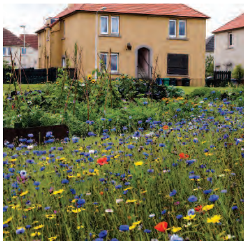
(left) A berm to discourage fly tipping. © A. Hogarth. (right) Annual colour in Kirkcaldy. © Growing Kirkcaldy.