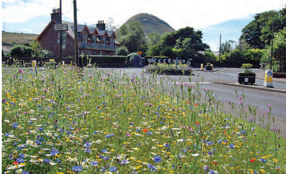
Cornfield annuals in North Berwick.