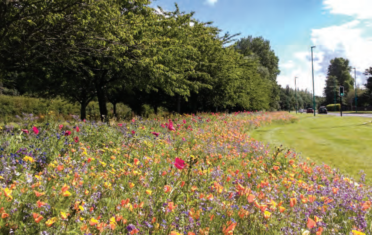
An annual mix brightens Riverside Drive in Dundee.