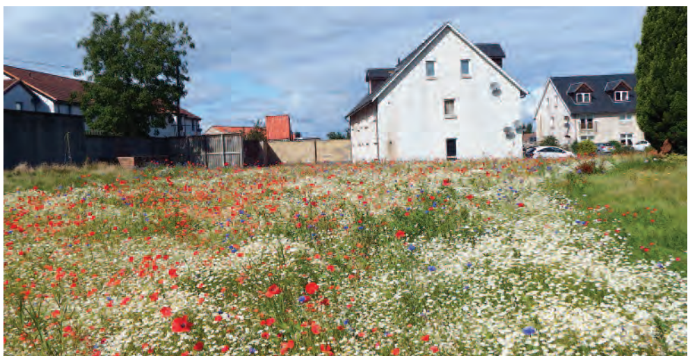
Very different results from the same seed mix in East Lothian.