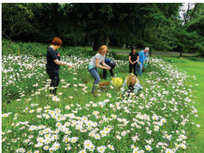
(left) Fife corn marigolds. (right) People enjoying the flowers in Fife.