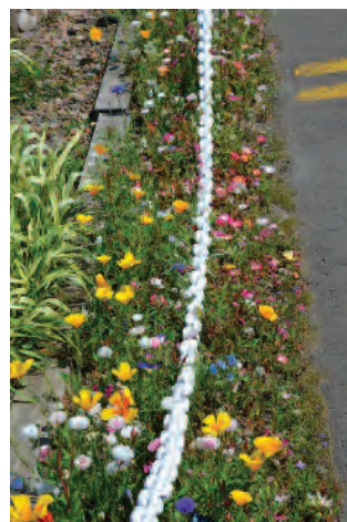
(left) Coreopsis dominates a Tranent roundabout. (right) Annuals in a narrow roadside strip.