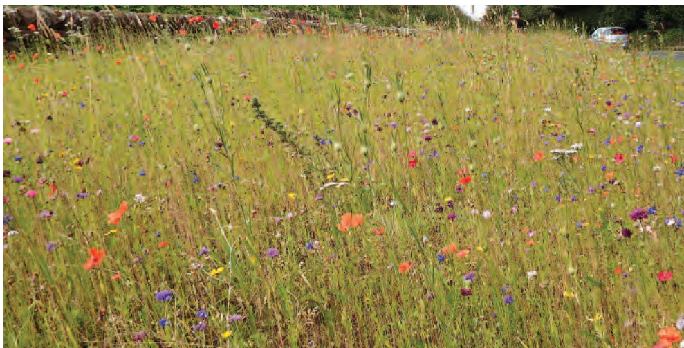
Grasses appearing in a bed left for more than one season.