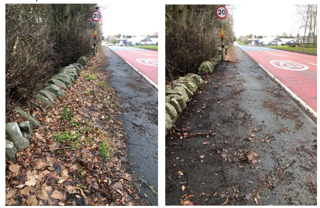
Clearing pavement detritus - before & after, January 2024.

Working hard to improve the first impression of our town by removing several years' worth of detritus from the pavements.