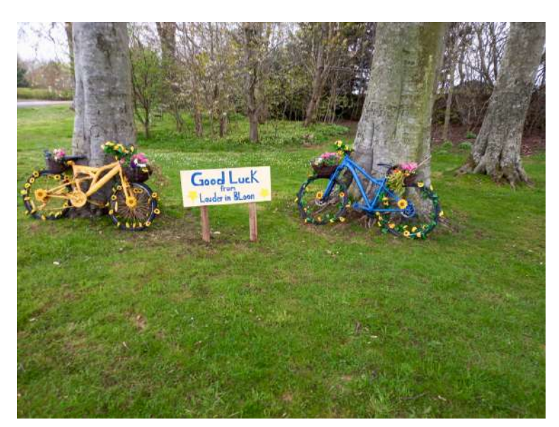
Sowing seeds with residents as the sheltered housing & Our display for the memorial bike ride, April 2024.