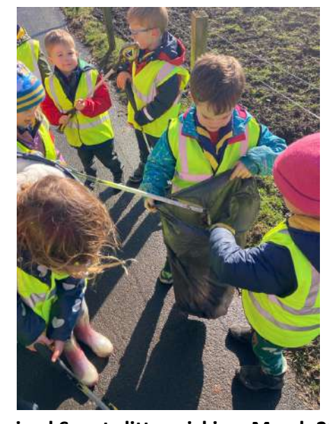
New compost bays made from reclaimed materials & Squirrel Scouts litter picking, March 2024.