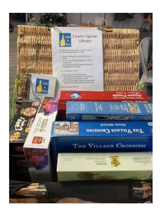
Lauder in Bloom - We Care About Here