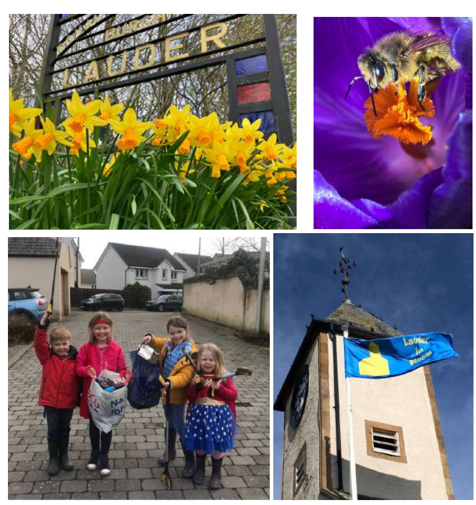
Daffodils at Lauder entry sign, March 2024. Bee on crocus, February 2024. Wonder Woman and friends litter picking, February 2024. Our flag, September 2023.

Lauder in Bloom (LiB) began in 2013 partly in response to a comment that Lauder is a long grey town and nothing much could be done about it! We began by adopting the handful of existing Council beds and neglected planters in the centre of town. Since then, we have expanded outwards adopting various un-loved areas and working with many other groups in our community. We currently look after 41 hanging baskets, 107 planters and 32 flower beds. Our aim is to keep our hometown looking loved, clean, green and tidy for all of us who live and work here and for all who visit, including our wildlife!