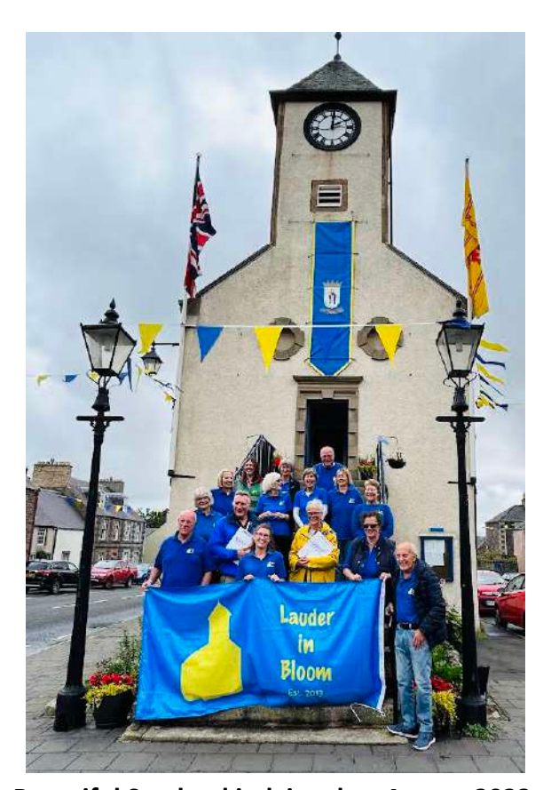
Beautiful Scotland judging day, August 2023.