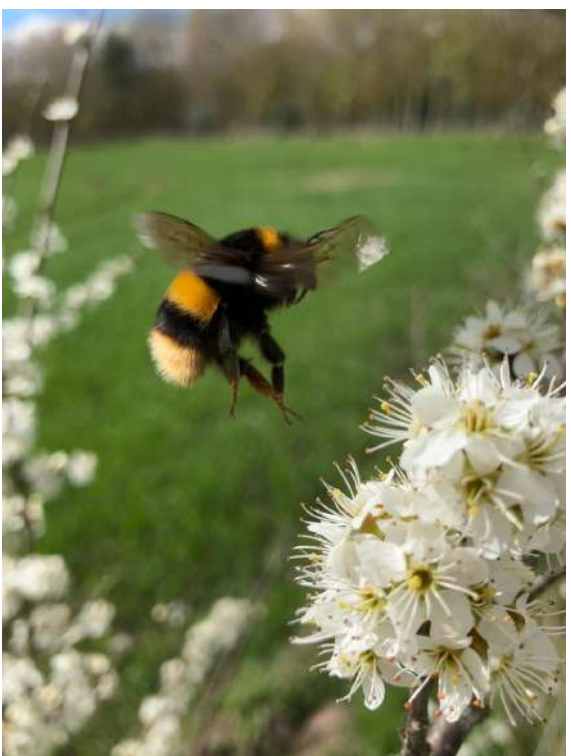
Publicising the Scottish Outdoor Access Code & Submitting data to the RHS Bumbles on Blooms project, April 2024.