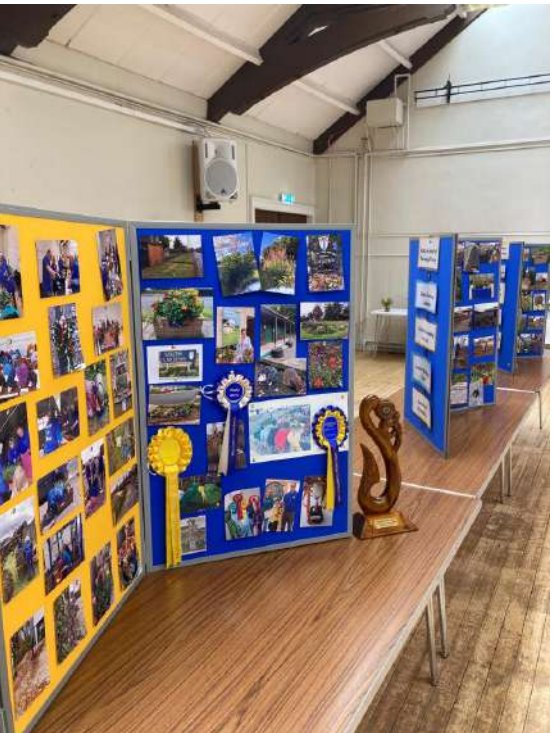
Displaying our awards and hundreds of photos from the past decade at our open community event, September 2023.