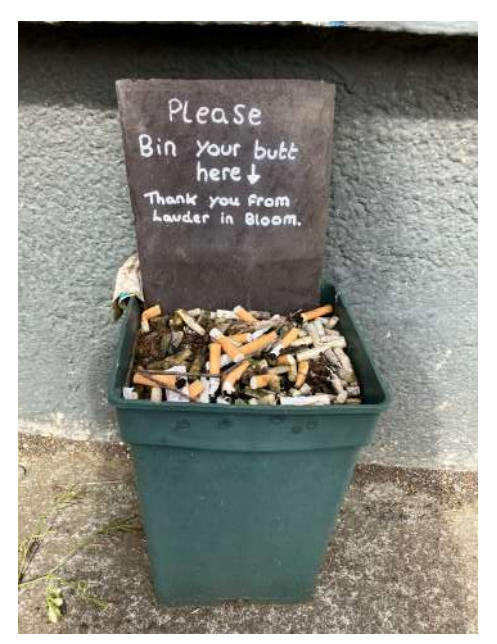
Dog muck bag dispenser & Butt bin, December 2023.