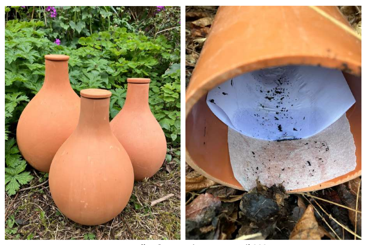
Terracotta ollas & Footprint traps, April 2024.