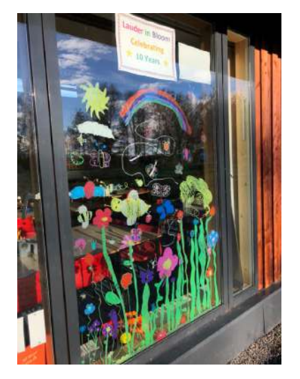
Lauder in Bloom - We Care About Here