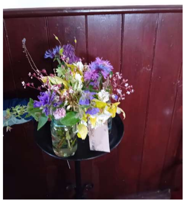
Repurposing old tyres and tennis racquets for our car show display, May 2024 & Jam jar posies using our blooms to decorate the church, June 2024.