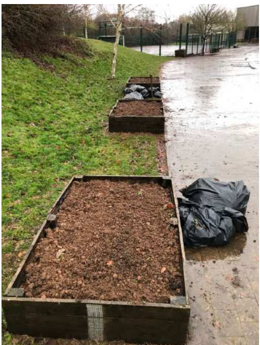
School planters before & after, December 2023.