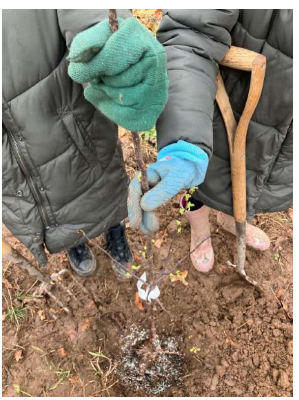
Sowing sugar snap peas with the Squirrel Scouts & Planting crab apples with Primary 4s, March 2024.