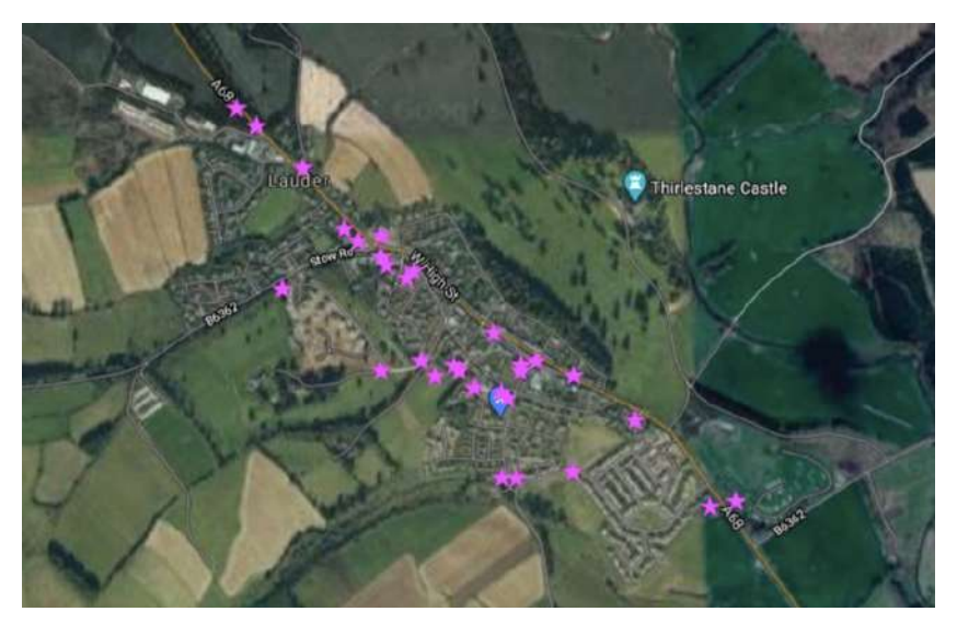
Aerial view of Lauder showing location of our beds.