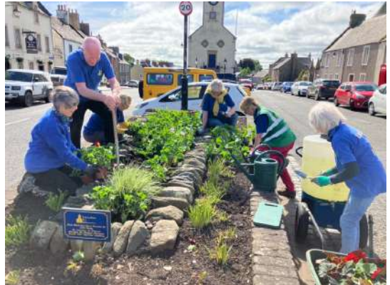
Locally sourced hanging baskets going up, summer bedding going in & new planters, June 2024.