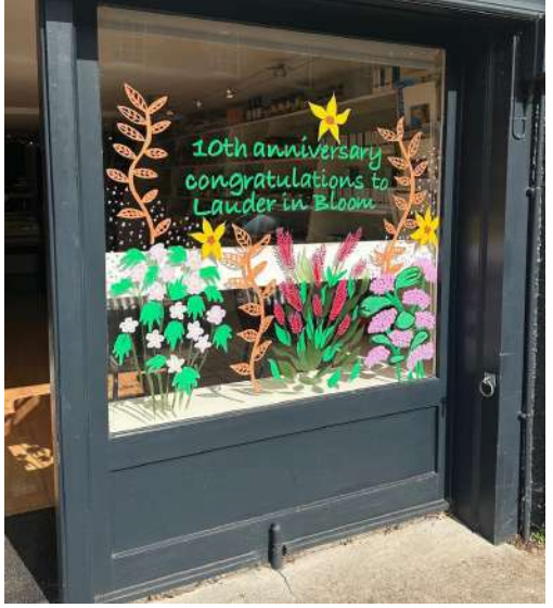
Meringue flowers at the bakers and local shop window displays, September 2023.