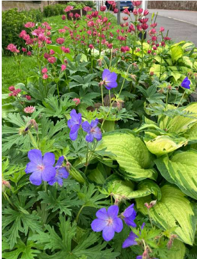
Summer blooms, June 2024.