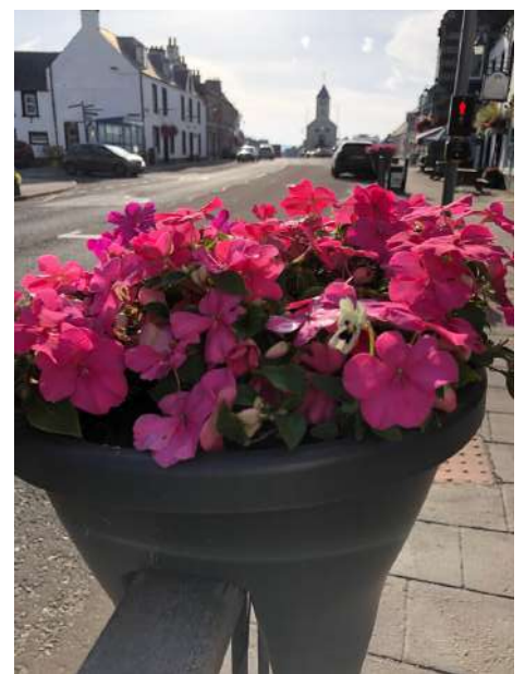
Late summer town centre blooms, September 2024.