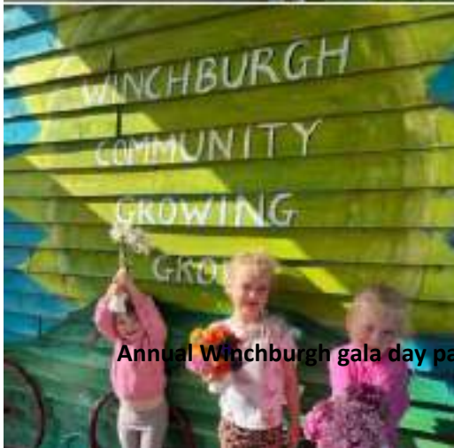
Annual Winchburgh gala day parade for Wombles and Growers

🥘 Volunteers enjoyed kebabs home made and cooked by Shaminder on the BBQ along with donuts with jam and ice cream - Delicious combi!