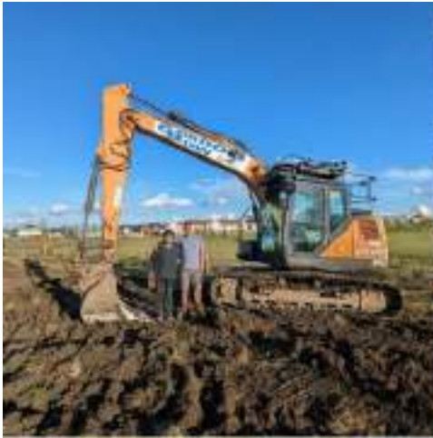
Auldcathie blank canvas – March 2022...