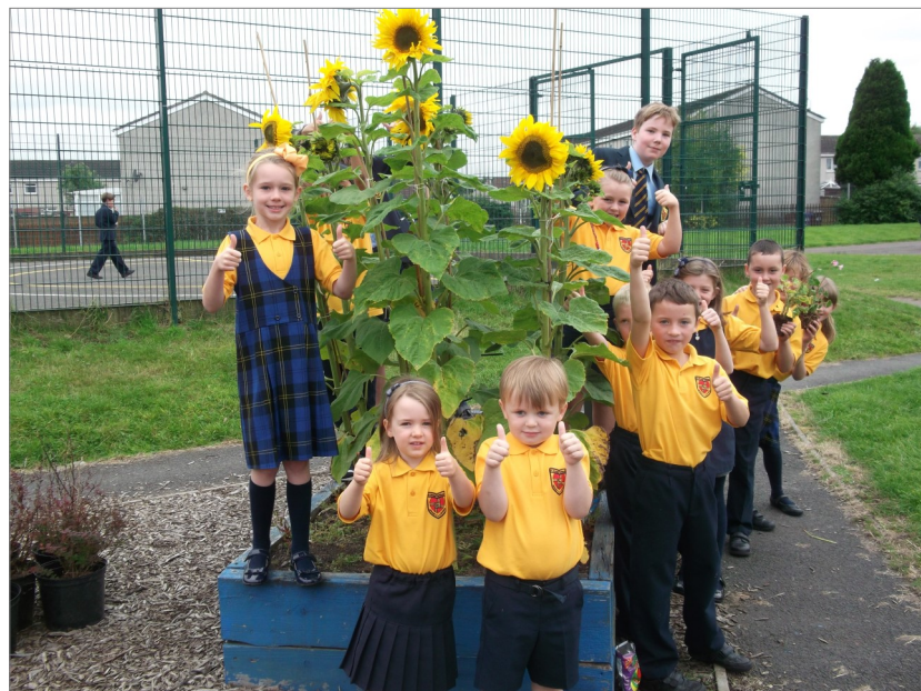
The sunflowers were not in bloom when the Beautiful Scotland judges visited on 8th August. However, they bloomed soon after and were still being enjoyed in September.