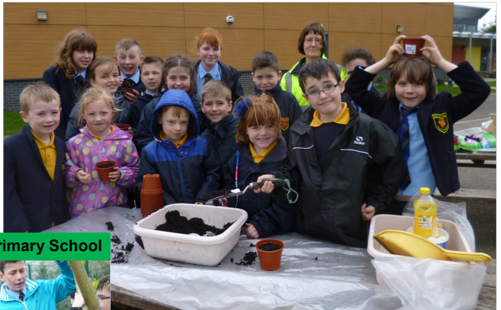
St Bride's Primary School

In April 2014, we worked with children from the two primary schools in Bothwell to plant the sunflower seeds that we received from RHS.