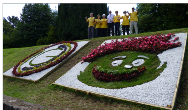
Our key floral display this year celebrated the Commonwealth Games, as we were near to some of the venues.