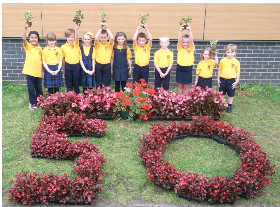
After the Games, many of the flowers used were recycled by the Janitor and pupils of St Bride's Primary School to create this display to mark 50 years of RHS Britain in Bloom.