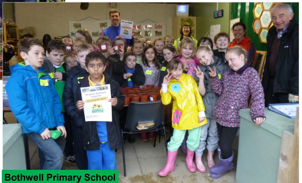
Bothwell Primary School

We worked with St Bride's Primary School children in their own school grounds. Children from Bothwell Primary School did their planting at Bothwell Community Garden