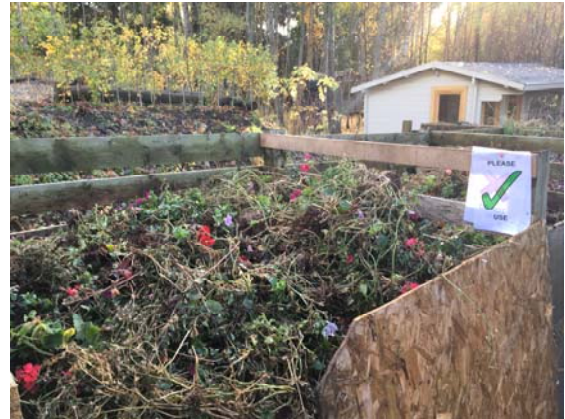
Compost bins