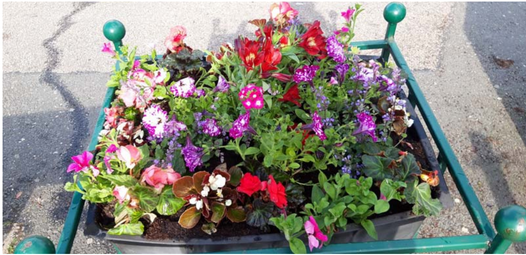
Mixed planting in former Council street furniture (June 2023)

IEI are responsible for 120 hanging baskets, 25 tiered and single planters in Inverurie town centre. There are 6 window troughs on the Town Hall and 8 barrier boxes on the car-park wall at Market Place. Although Aberdeenshire Council maintain the planting in the Memorial Garden, this complements the work done by IEI in the Town Centre. New seating in the Memorial Garden is provided by BID. The aim is to provide an abundance of colour throughout the summer for residents and visitors. Winter bedding plants are bought in to provide a display of colour between November and May in the planters.