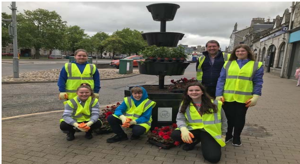
Eco-school S2 pupils with summer bedding plants (June 2019 Pre-Covid)

Pre Covid-19 the Eco-school Committee was established in 2019 when a group of S2 pupils felt there needed to be a more coordinated approach from Inverurie Academy regarding environmental issues and helped IEI with planting as per the photo below. Post Covid-19, the Guidance Teacher at the new Inverurie Community Campus has recently asked IEI for support in starting a new eco-gardening club at the Academy.