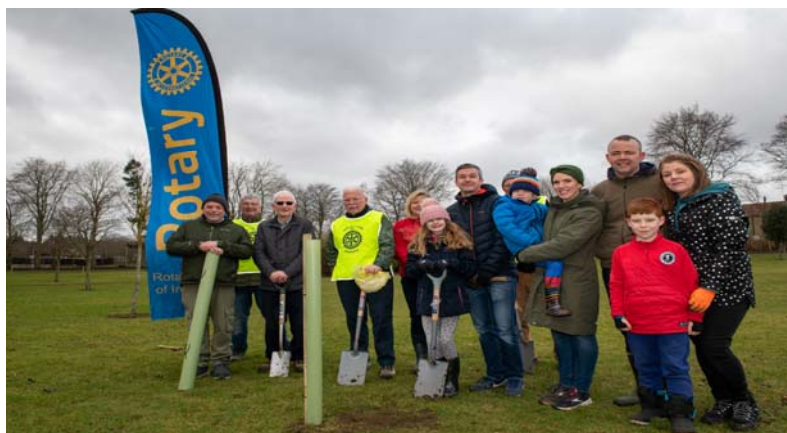
Community tree planting at Kellands Park (March 2023)

Inverurie Community Council and Rotary Club of Inverurie supported local families and residents in joining in the planting of many trees around Inverurie.