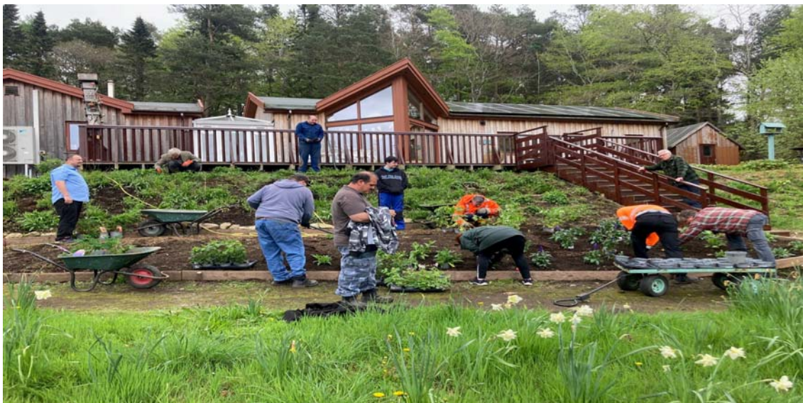
Service users planting pollinators at the Buzzard Café (May 2023)

There has been great progress so far on the service users' 'Butterfly Garden' in front of the Buzzard café at Pitscurry, hopefully you will see some beautiful blooms come summer, and lots of pollinators coming to visit! Huge thanks to Pitscurry's team of volunteers as well as everyone on site, and to Action Earth for help with funding.