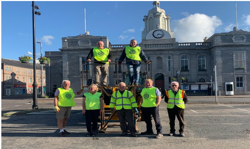
Team from Inverurie Rotary Club putting up the hanging baskets (July 2023)

Inverurie Rotary Club members provide support to IEI with help to put up and take down the hanging baskets. Rotary are involved with many other community projects as well.