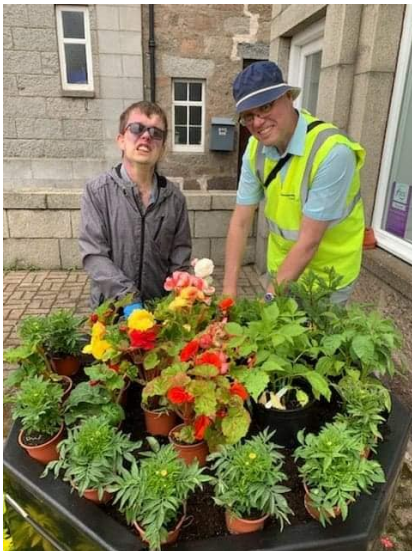
DAYS service users planting (July 2022)