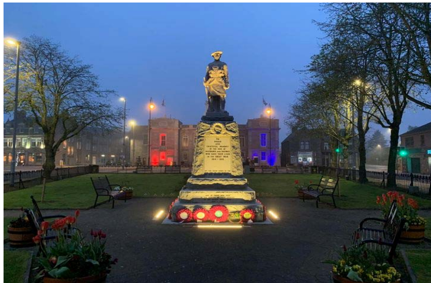
Inverurie Town Hall and War Memorial garden as part of the Coronation Weekend celebrations including the Lighting Up the Nation Project. (7 May 2023)