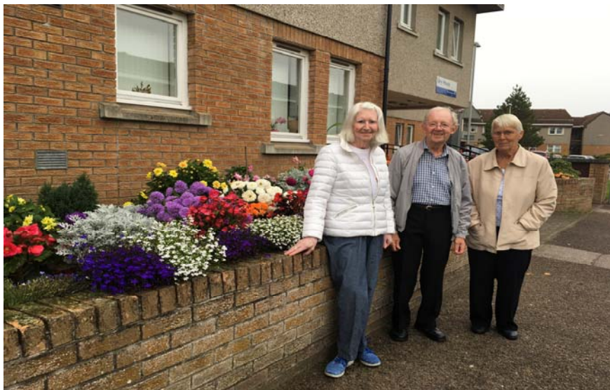
Ury House residents are keen gardeners

IEI provides assistance to Sheltered Housing residents who are no longer able to maintain the garden areas surrounding their homes. IEI distributed 40 bags of compost to sheltered housing residents in the Spring to enable them to grow their own seeds and plants.