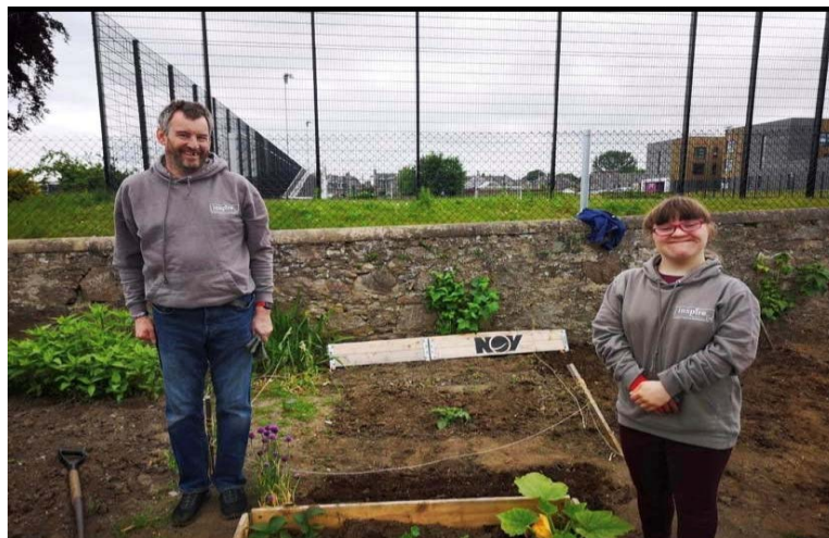
Inspire service users in the Community Garden (June 2023)

IEI will encourage the above service user providers to look at joining The Caley Awards 'Grow and Learn' scheme to enhance their gardening experience.