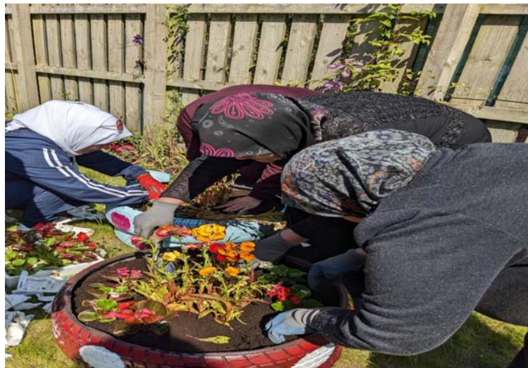
Al-Amal group planting 'teacup' planters (June 2023)

The garden also provides horticultural activity space for service users from Grampian Opportunities and Inspire by Inverurie to carry out gardening projects with people who need support. A group of Syrian women from the Al-Amal & Friends Project spray painted old tyres to make giant 'teacup' planters so IEI donated trays of small begonias and trays of tall nemesias to be used in the planters.