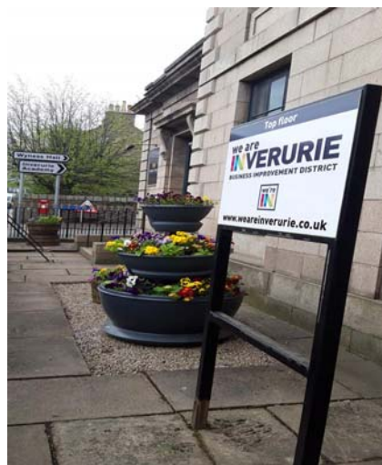
1 High Street (May 2023)