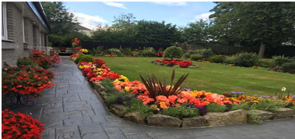
Best Large Garden and Overall Winner 2022 (Archive Photo)

The Gardening Competition is run annually for residents, commercial and non-commercial premises. The aim of the Best Garden Award competition is to draw attention to the contribution that Inverurie's many gardeners make to the visual quality of the town and to encourage others to do the same. This is an excellent opportunity for the local community to get involved in making the town look vibrant, whilst receiving the praise and recognition they deserve for their efforts in maintaining wonderful front gardens. The judge looks for the good use of colour and form in the garden as well as imaginative design, a long season of interest and environmental sensitivity.