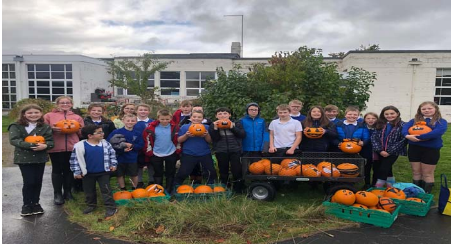
Kellands Primary P6GS Pumpkins at Donbank Ward (October 2022)

Kellands Primary P6GS are working to help enhance Donbank Ward garden at Inverurie Hospital for the patients to enjoy. The class have been carving pumpkins to bring a smile to the patients and using their new garden trolley donated by IEI. It's good to be part of another project that helps the pupils upgrade the hospital garden.