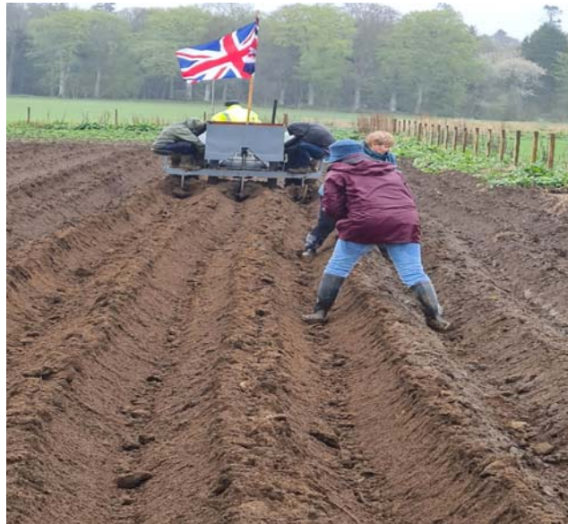
Howe Community Farm tattie planting (May 2023)

Inverurie Men's Shed have utilised a 2-acre field in the River Ury floodplain as a seasonal community farm whereby local families come together as a co-operative to grow vegetables and soft fruit for their households. This is an environmentally friendly way of re-using fallow farmland during the non-flooding seasons. 'Elvis' the 1952 grey Fergie has a tattie planting plough attachment bought with an IEI donation of £1,000 in 2022.