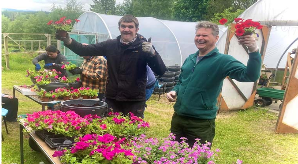
Pitscurry service users planting the hanging baskets (June 2022)

The service users put new wicks, mats and compost into the baskets before planting them. They do a fantastic job every year and take great pride in seeing the hanging baskets in Inverurie town centre and the pleasure they bring to residents and visitors to the town.