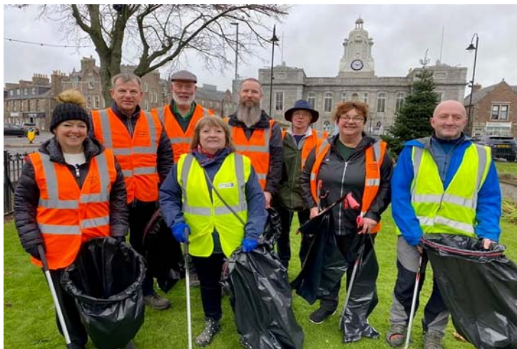
Community Council monthly litter picking (May 2023)

IEI supports regular community litter picks in the Town Centre. These also include organised litter picks along the River Don and Ury Riverside Park. The Aberdeenshire Litter Initiative encourages residents to become registered litter pickers and collect litter in their own streets on a regular basis.