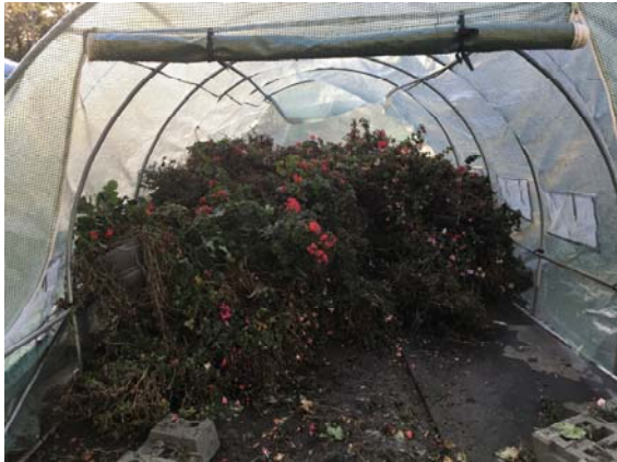
Baskets waiting to be composted at Pitscurry

At the end of the season the plants from the hanging baskets and planters are composted by the service users at Pitscurry with the compost used within the Pitscurry site.