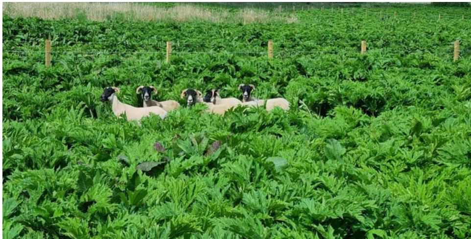
Herd of sheep controlling giant hogweed at Ury Riverside Park (May 2023)

Aberdeenshire Council and Ury Riverside Park SCIO are trying to control the giant hogweed that is growing within the park. Spraying the plants and mowing have been effective in some areas, but this is not always practical. Sheep have been shown to be highly effective by eating seedlings and small plants, and also pushing over and eating large plants. This helps stop the giant hogweed flowering and setting seed.