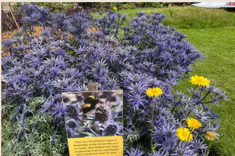
Sustainable Coastal Planting. Sea Holly (Eryngium)