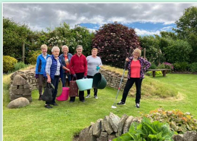
Some of the Thursday morning group Edging, Hoeing and weeding. Other volunteers participate in a mowing rota.