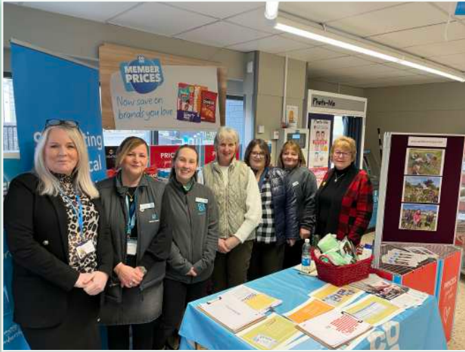
East Haven is one of the Co-op's Community Groups in 2024. In store events held to raise awareness about our work.