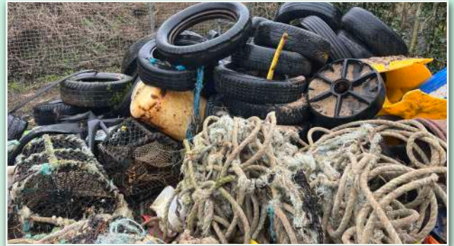
Typical large items above and millions of pieces of small plastics as below