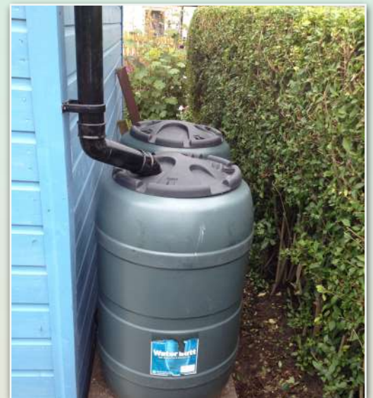
Water recycling system. Water Butts drain into a bespoke tap ready to fill watering cans.