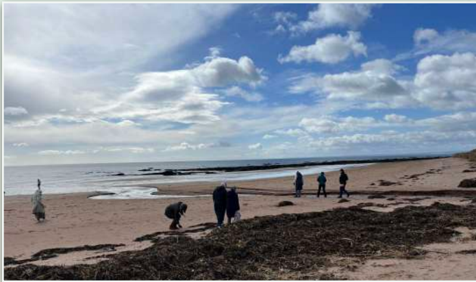
April 2024 - Welcome to New Scots living in Dundee and Angus. Learning about Scottish heritage, nature and environment.