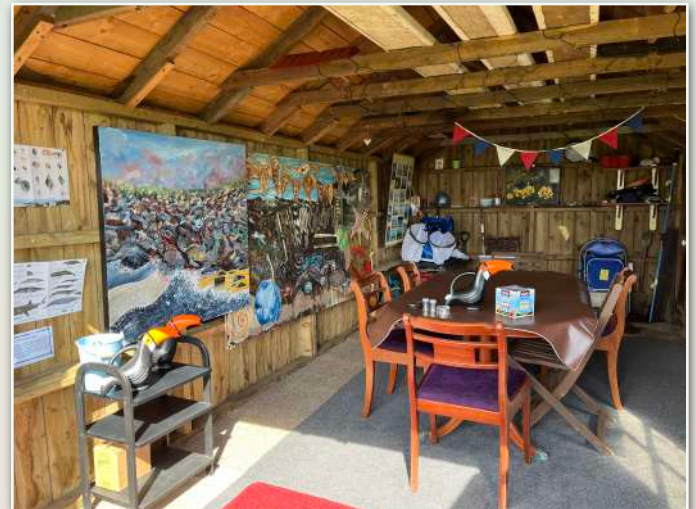
The outdoor learning classroom on the croft.