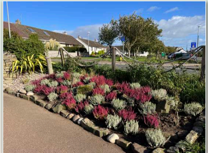
Heathers displayed at the Dunhill Cup were up cycled and replanted in East Haven. Oct 2023