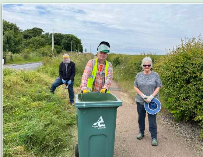
Cutting back and strimming along the road verges to make it safer for vehicles and pedestrians at the cycle path corner.