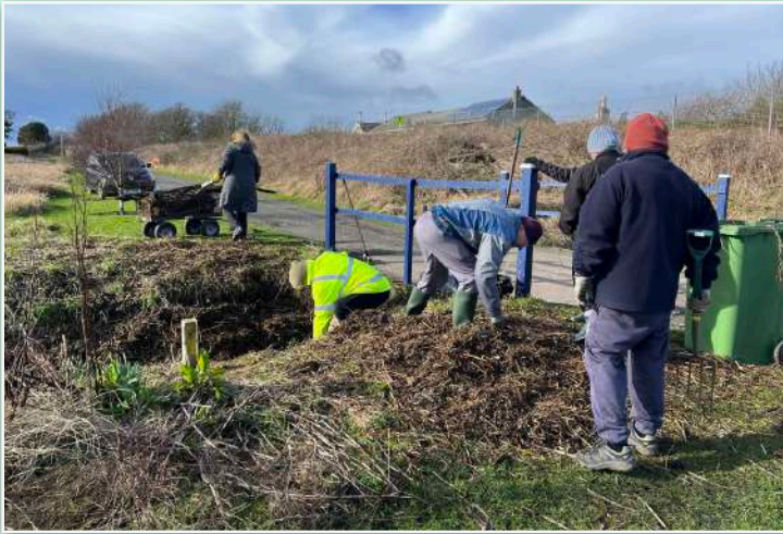
Unblocking the burn and clearing litter was relentless between October 2023 and April 2024