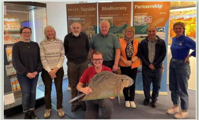
EHT has delivered presentations about coasts and sustainable communities to seven organisations.