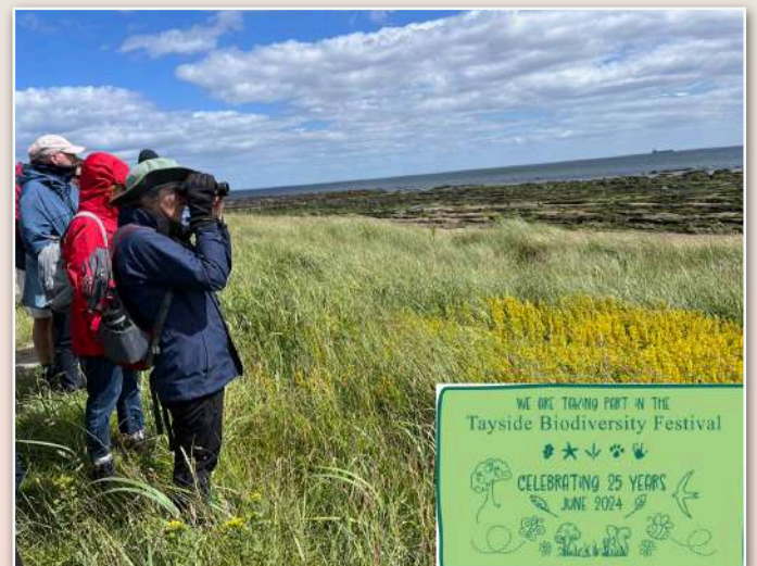
EHT supported a number of events in celebration of 25 years of the Tayside Biodiversity Partnership.