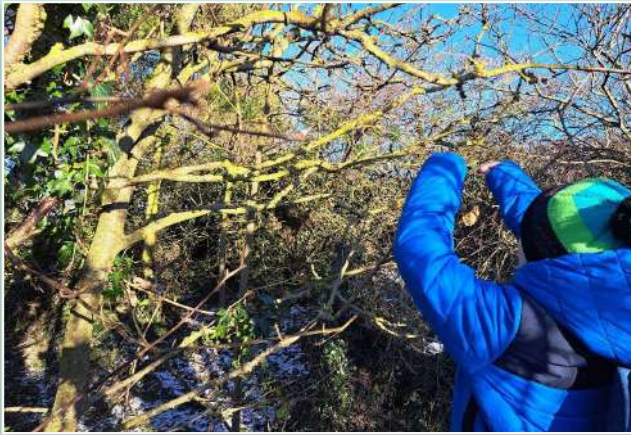
Children from Ladyloan Primary School making bird seed cake and tying it to trees in January 24