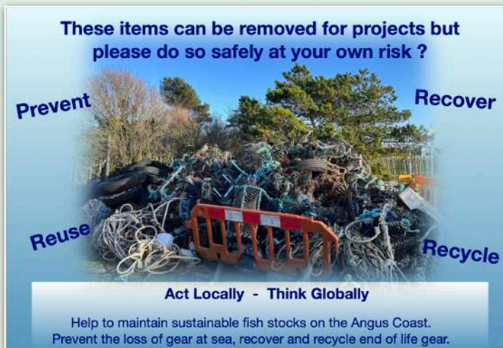
Schools, artists and Gardeners regularly take items for up-cycling and learning exercises.