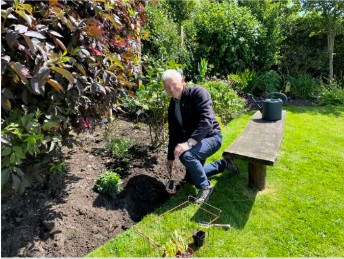
Bedding plants grown from seed such as Petunias and Evening Primrose.