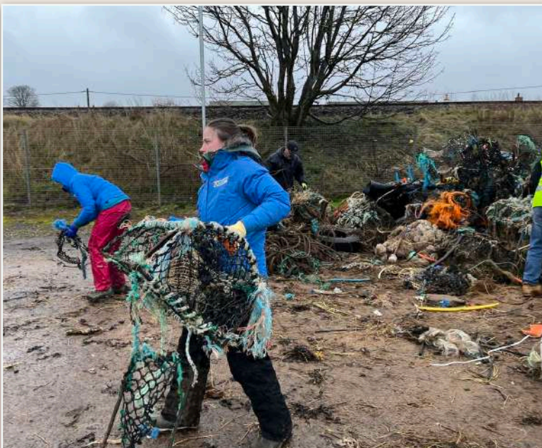
EHT was very grateful for volunteer support to move all the heavy waste fishing gear from the car park to a waiting skip in the village square. It was an awful day but people worked really hard to complete the job.