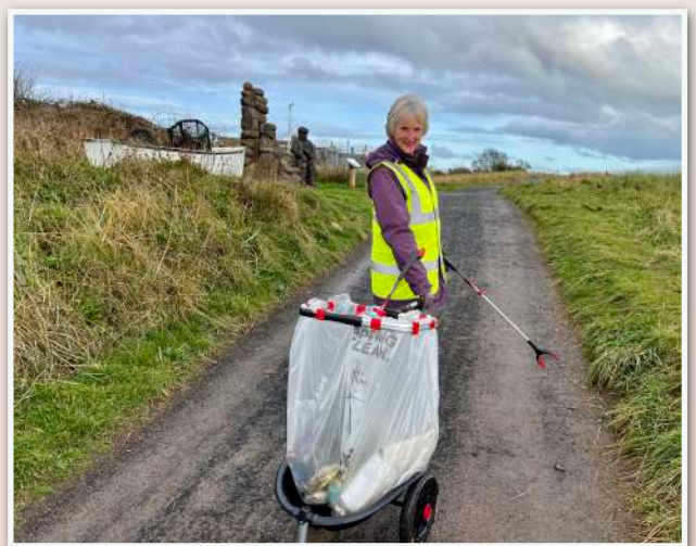
Keeping the beach and cycle path clean and welcoming. Helps to influence public behaviours and sends a clear message of pride in place