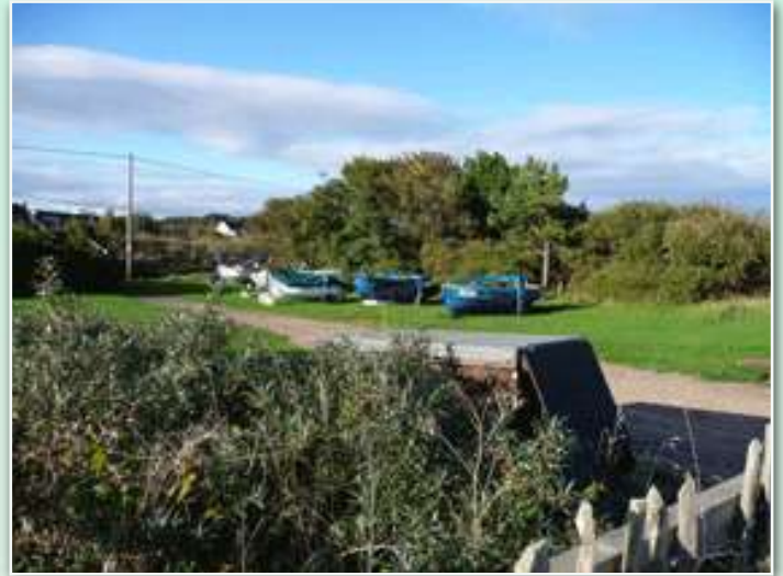
Volunteers removed a number of trees affected by Ash Dieback in December 23