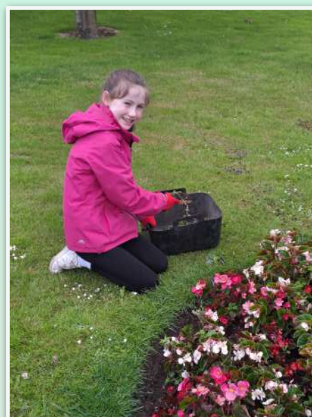
One of our younger volunteers. Always keen and enthusiastic.