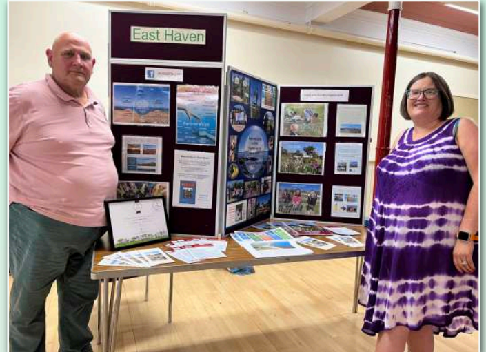
East Haven at the Angus Tourism Exhibition in May 24. The importance of volunteers and pride in place.