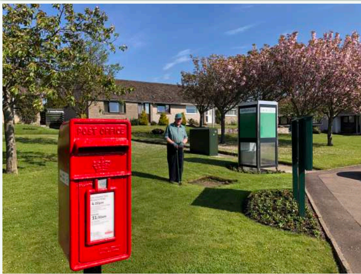
Planting around the notice board and Defibrillator