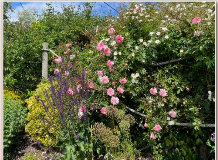
Rambling Rose Seagull and Rambling Rose Rector in full bloom July 2024