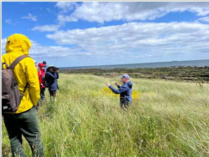
Ecologists and wildlife experts sharing their skill, knowledge and expertise

Glasgow College of Art Students spent two days in East Haven carrying out a project on coastal festival gardens and talking to residents https://readymag.website/u4074933783/4746512/