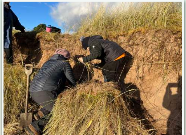
Children from Ladyloan Primary school planting Lyme and Marram grasses grown from seed in January 2024.

EHT began measuring dunes from fixed points over 30 years ago on the advice of NatureScot and other partners. This data has enabled us to monitor the impact of natural conservation methods on erosion and accretion levels. The data has been shared with the Scottish Government Coastal Adaptation Team, Universities and other agencies.