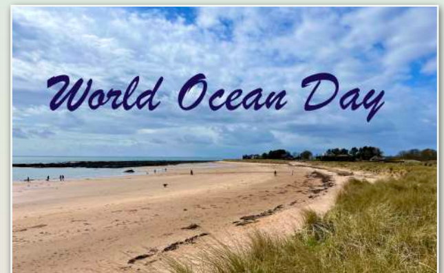
A beach clean with Aberlemno Primary School on 7th June 2024. All data uploaded to MCS