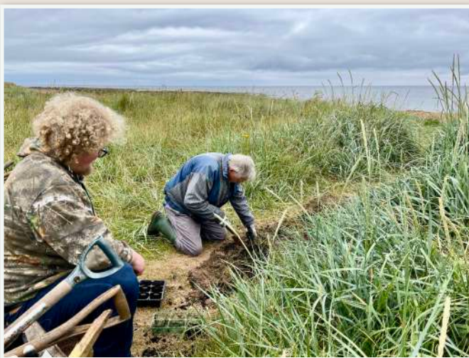
More planting of native Lyme and Marram grasses in July 24. Large amounts of invasive Rosa Rugosa also removed.

EHT began measuring dunes from fixed points over 30 years ago on the advice of NatureScot and other partners. This data has enabled us to monitor the impact of natural conservation methods on erosion and accretion levels. The data has been shared with the Scottish Government Coastal Adaptation Team, Universities and other agencies.