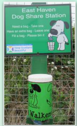
Dog Share stations

Sustrans Bumble Butterfly Transect 2018 -2024 Data uploaded to UKBMS