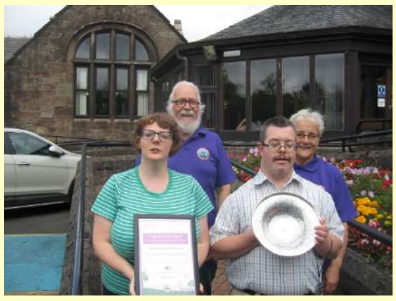
The ARC Members pictured with the Community Involvement Trophy