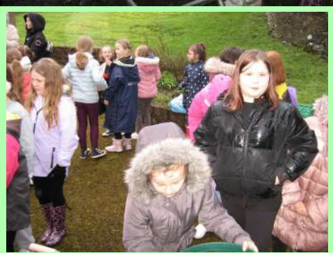
May 2024: A local resident who runs a Liv-Has given us unlimited access to Organic horse manure. We have applied a layer of this To all our Flower containers followed by a top Up of Peat Free Compost, this form of natural Feeding is full of vital nutrients such as Nitrogen, Phosphorus & Potassium which the Plants will benefit from.