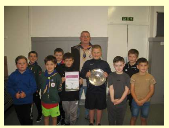
The Brownie group with the Trophy & Certificate