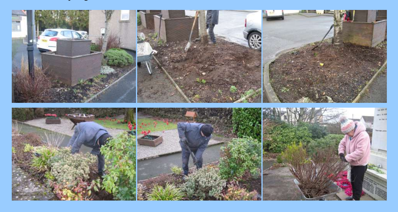
April 2024: Spring Flower Displays

February 2024: The Large bed at the Car Park was in need of an overdue face lift. All the Shrubs were dug out & re-planted at the War Memorial garden. A mixture of Pollinating Herbaceous Shrubs will be Planted in the Spring.