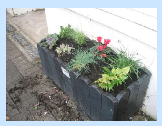
October 2023: Daffodil planting with the ARC Members