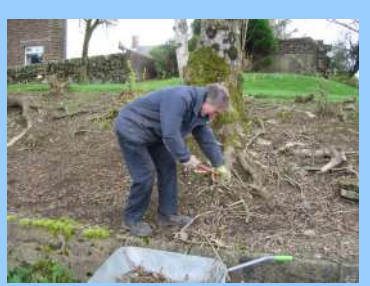
April 2024 : We cleared the large flowed bed at the Main Street car a few Months ago to enable us to

give the bed a complete face lift. A variety of sustainable pollinating shrubs was selected such as Penstemon, Salvia, Verbascum, Echinops, Campanula. These shrubs will bring a lovely Variety of colour as well as attracting our wildlife.