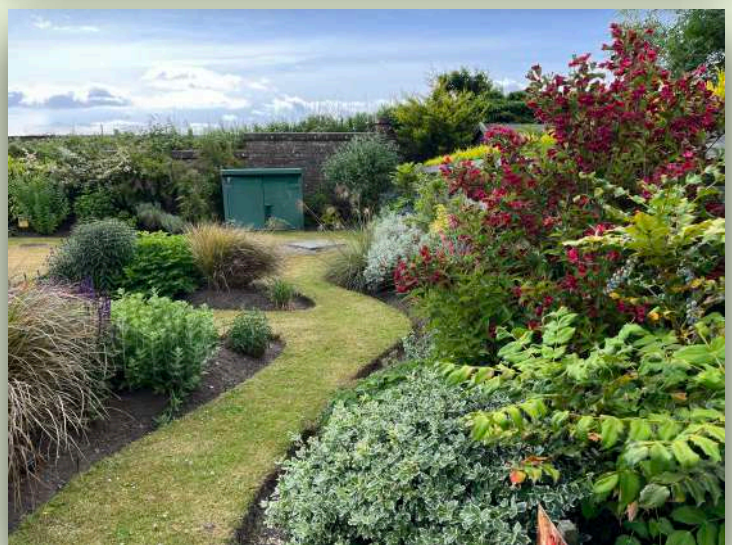
Carefully managed coastal shrubs with all year round colour