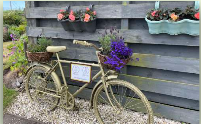
Welcome to East Haven. Flower bike on National Cycle Network 1 filled with bee friendly plants