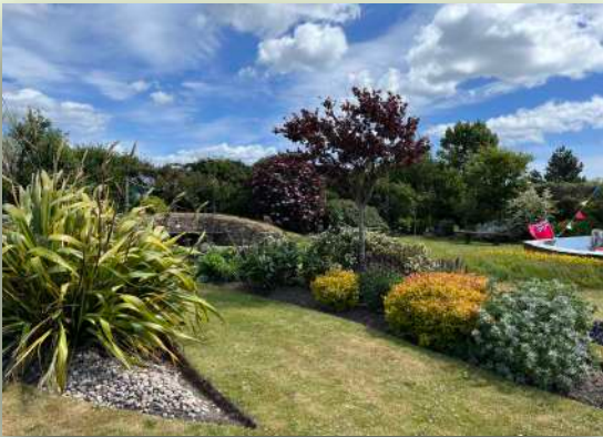
Regular hoeing, weeding and edging