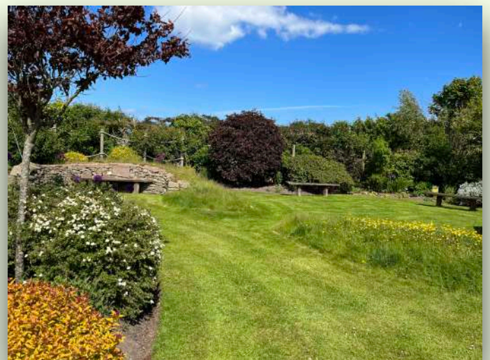
Mowing rota from March to October ensures the grasses are maintained throughout the season.