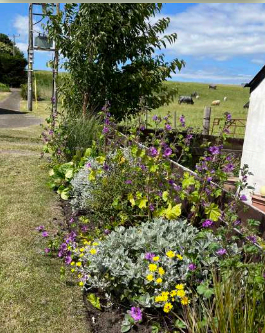
Bee loving annuals and perennials grown from seed including Agastache, Lychnis Vesuvius, Nicotiana and Cosmos