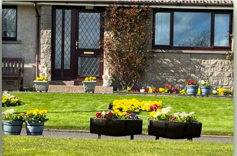
Beautiful spring colour across the village