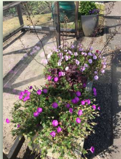
Sustainable Coastal Planting