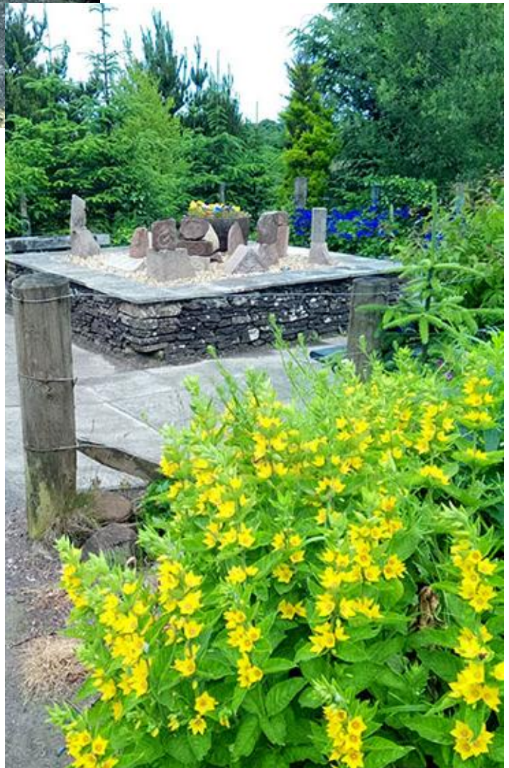
Carved stones were installed at the Forth Gateway Garden. The carvings were done by local residents and represent Hope, Peace & Friendship.