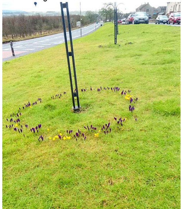
Crocuses at our hanging basket trees on Longdales