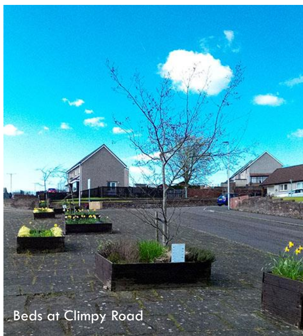
Beds at Climpy Road