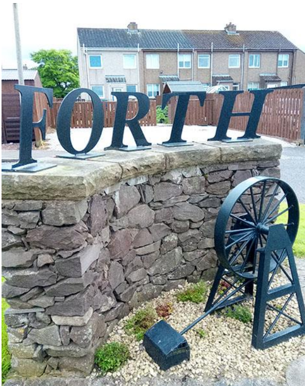
Our mining wheel at the Climpy Road Gateway, where we have recently added rockery plants.