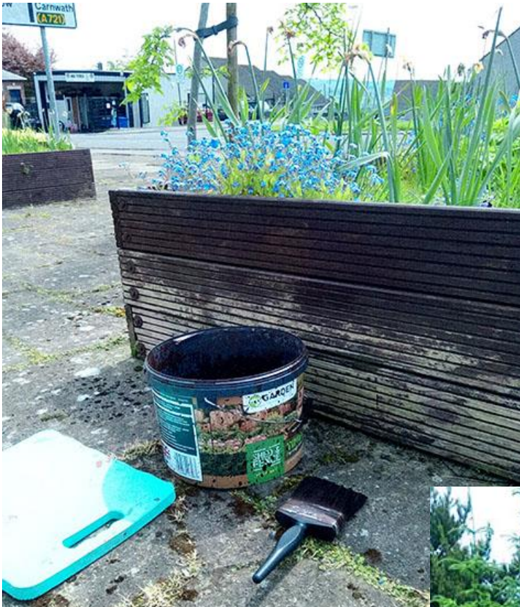
Painting our planters on Climpy Road. The Community Payback team also painted our indoor and outdoor beds during the Spring.