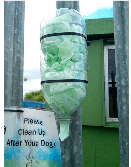
One of the poo bag stations located around Forth.