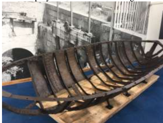
Canal inspection boat reclaimed and renovated (2024)

The Aberdeenshire Canal boat used for inspection & ice breaking in the early 1800s, has been restored and is now on display in the Garioch Heritage Museum.