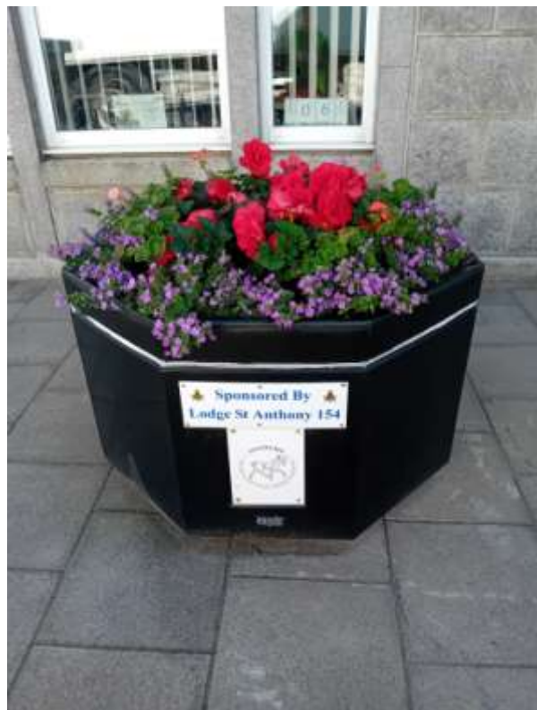
Sponsored planter (June 2025)