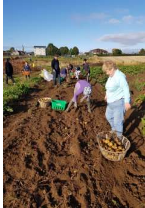
Howe Farm - Tattie Picking (October 2023)