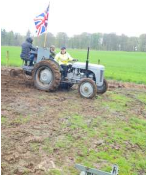
Howe Farm - Tattie Planting (May 2023)

After the success of setting up community allotments in 2021, Inverurie & District Men's Shed (IDMS) still had a 1.5 acre field but couldn't have allotments on it as it was on the River Ury flood plain. It was the best of agricultural land. A community cooperative farm was set up with seven families joining. The community farm grows potatoes, turnips, strawberries, beetroot, cabbage, carrots, Brussel sprouts, leeks and cauliflower. They have also created an orchard with apple and plum trees.