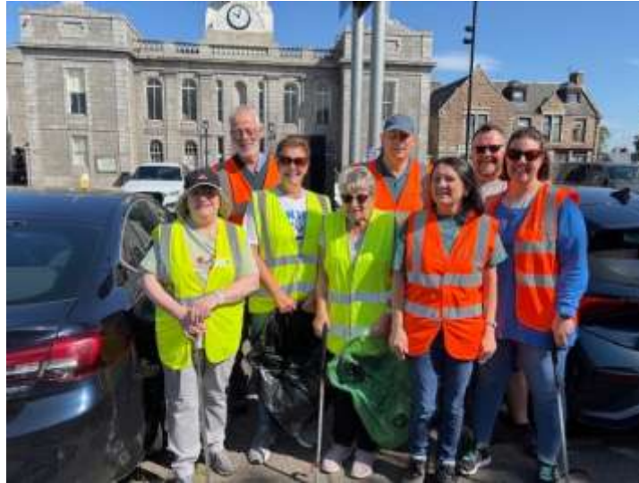
ICC Volunteers meet for their monthly litter-picking session (June 2025)

IEI and Inverurie Rotary support regular community litter picks in the town centre organised by Inverurie Community Council (ICC). These also include organised litter picks along the River Don, Inverurie Town Centre, Port Elphinstone and Ury Riverside Park. The Aberdeenshire Litter Initiative encourages residents to become registered litter pickers and collect litter in their own streets on a regular basis.