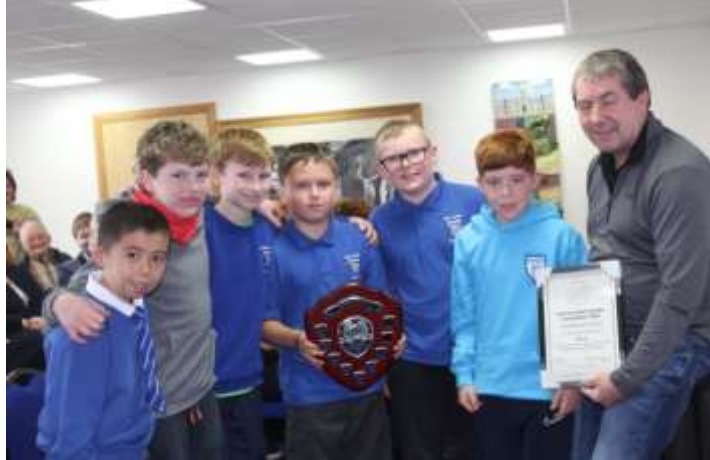
Kellands Primary P6 Discretionary Award for Donbank Ward Garden (September 2024)

The Kellands Primary School have an allotment for teachers and pupils to learn and have fun in growing their own vegetables. The experience and skills learned at an early age in horticulture can lead to a lifetime hobby of gardening which can be enjoyed at any age. The pupils also continue to be involved at Inverurie Hospital. P6 pupils are active throughout the year helping to maintain and enhance the Donbank Ward Garden.