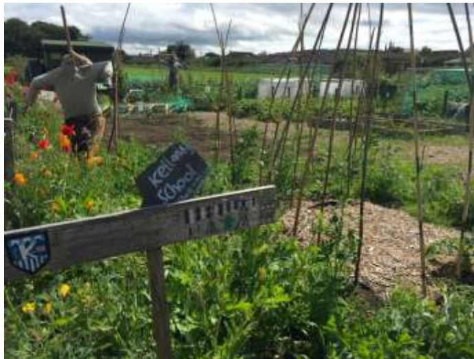
Kellands School Allotment for pupils & teachers