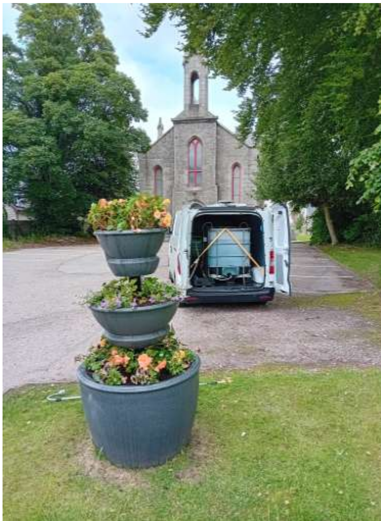
St Mary's Church with summer bedding plants being watered by electric vehicle (June 2025)

IEI is responsible for 120 hanging baskets, 30 tiered and single planters in Inverurie town centre. There are 6 window troughs on the Town Hall and 8 barrier boxes on the car-park wall at Market Place. Although Aberdeenshire Council have maintained the planting in the Memorial Garden, financial constraints on Council budgets make this maintenance more challenging to carry out in the future. New seating in the Memorial Garden is provided by BID. The aim is to provide an abundance of colour throughout the summer for residents and visitors. Winter bedding plants are bought in to provide a display of colour between November and May in the planters.