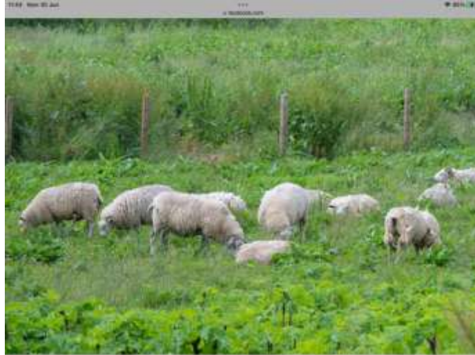
Sheep grazing to control spread of giant hogweed (June 2024)

Some local provenance wet meadow perennial wildflower seed was planted in some of the areas of bare soil which will help stabilise the soil and in time some of the perennial wildflower plants will replace the giant hogweed where the sheep are grazing.