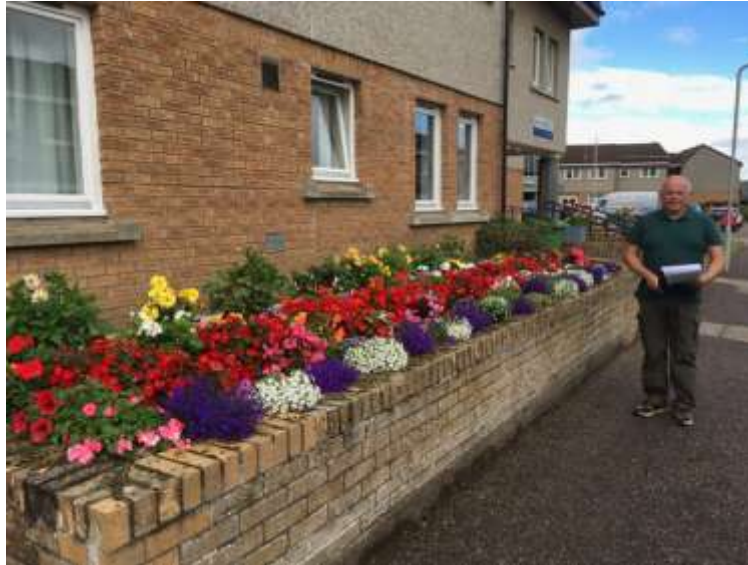
Ury House, Overall Winner Garden Competition 2024 (Judging Archive Photo 2022)

IEI provides assistance to Sheltered Housing residents who are no longer able to maintain the garden areas surrounding their homes. IEI distributed 20 bags of compost to sheltered housing residents in Spring 2025 to enable them to grow their own seeds and plants.