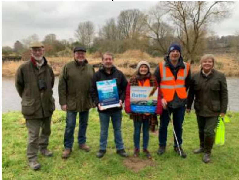
IEI supporting and raising awareness of the KSB Upstream Battle Campaign

Keep Scotland Beautiful (KSB) initiated a national campaign to tackle marine litter from its source by changing behaviour and preventing litter from reaching waterways and having impacts on wildlife and biodiversity.