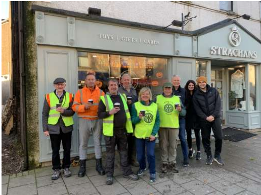
Team from Inverurie Rotary Club taking down the hanging baskets (October 2024)

Inverurie Rotary Club members provide support to IEI with putting up and taking down the hanging baskets. Rotary are involved with many other community projects as well.