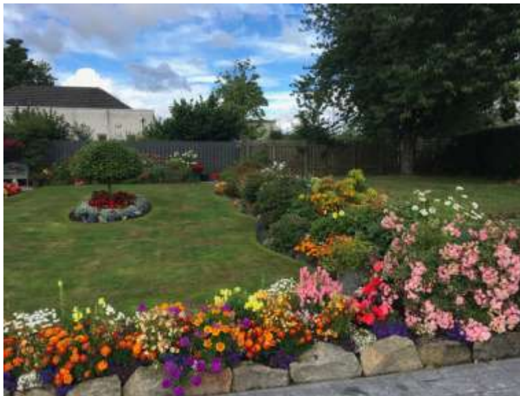
Elsie Thomson, Winner Best Garden Competition 2024