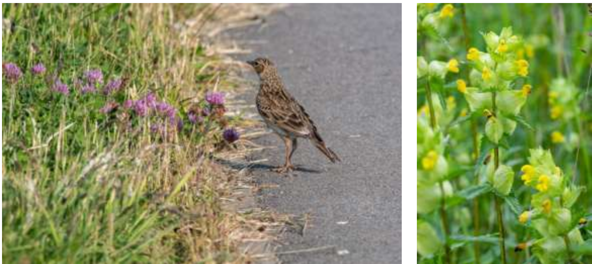
Ground-nesting skylarks and wildflower meadows

There are areas of semi-natural wetland, riparian habitats, new native woodlands, wildflower meadows and amenity grassland. The park supports breeding skylarks, common partridge, reed buntings, yellowhammers, and sedge warblers. Otters and trout live in the river along with a range of dragonflies and damselflies. The wildflower meadows attract a range of pollinators such as butterflies, bees, hoverflies etc.