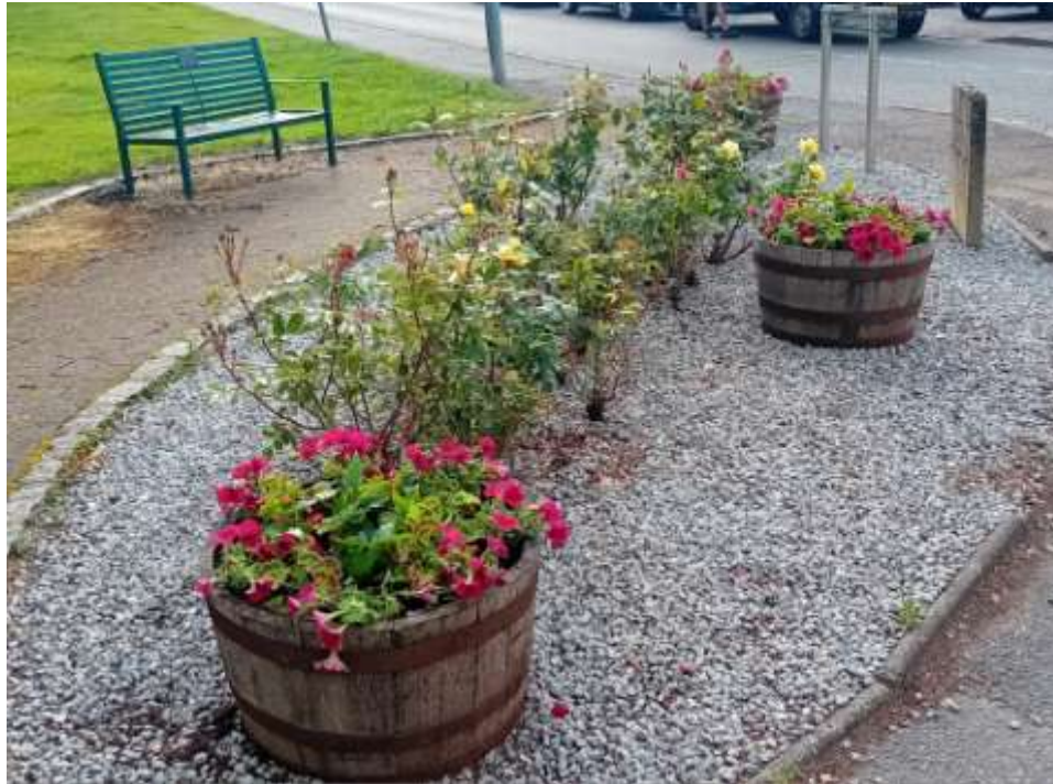
Former Council bed at Cunninghamhill Road with new planting arrangement (June 2025)