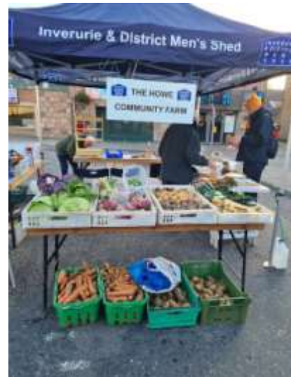
IDMS Stall at Farmers Market (2024)