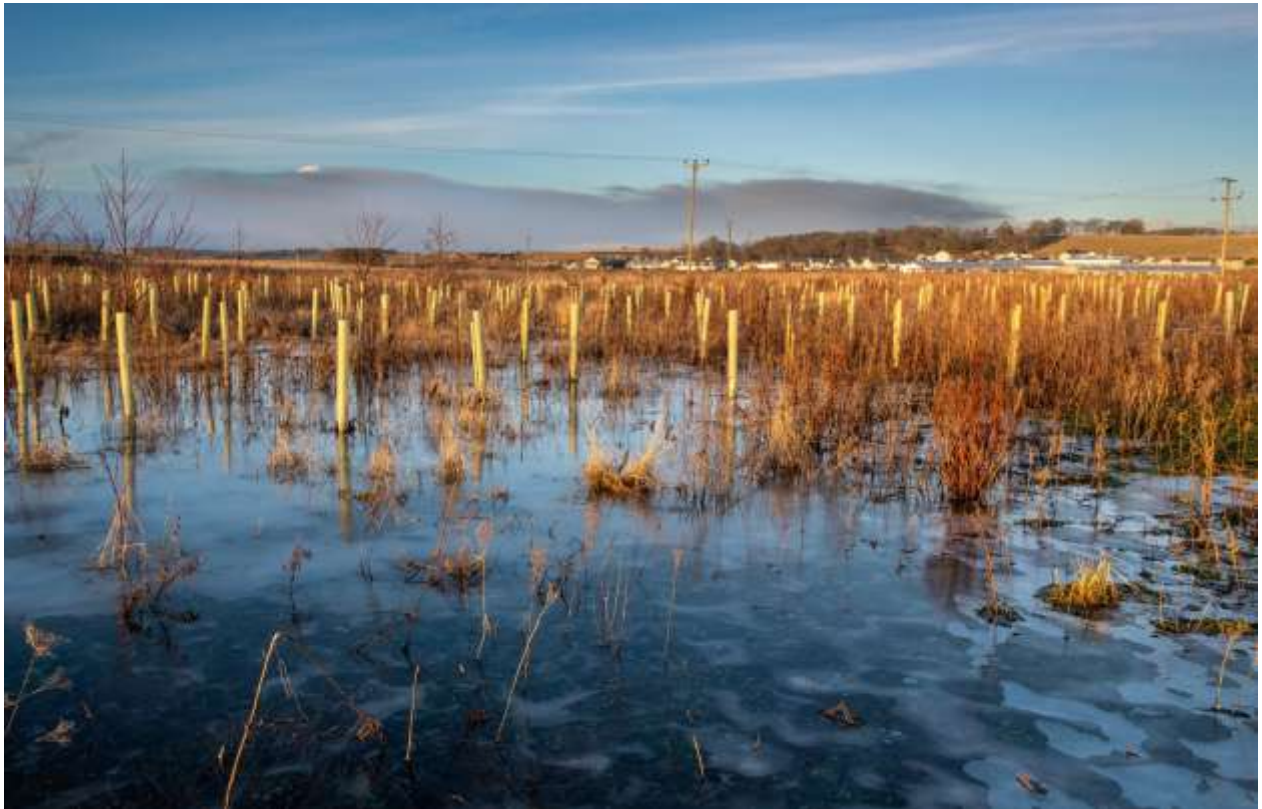
Ury Riverside Park Floodplain