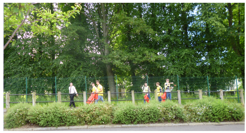
Setting off with litter pickers and refuse bags.