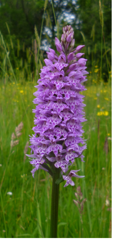
Our lovely wild orchids were seen by those cleaning up along Bothwell Nature Trail.