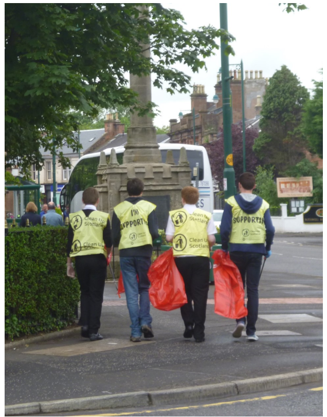
Setting off along the Main Street.