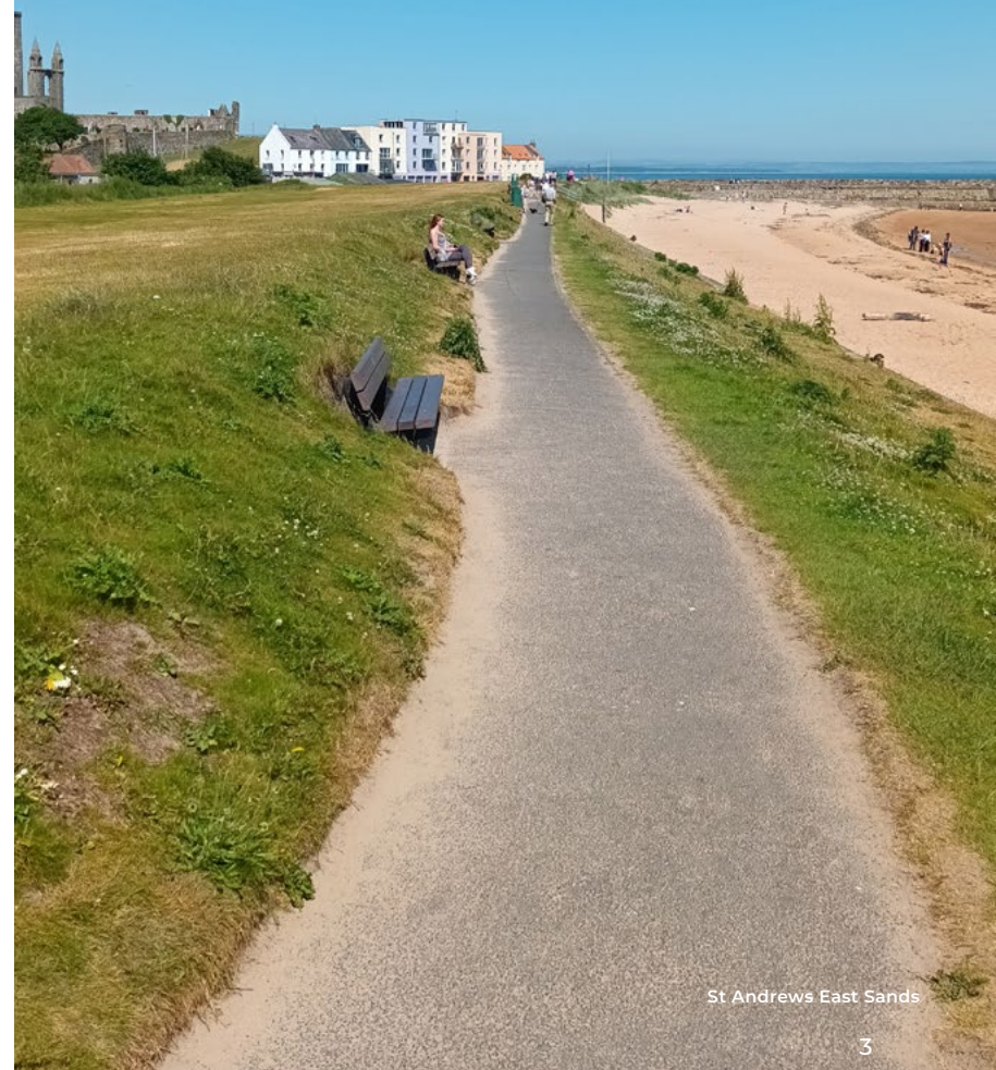
St Andrews East Sands