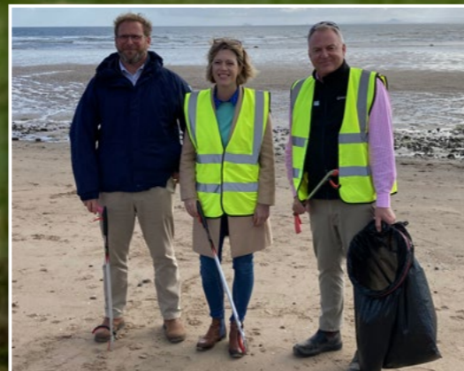
We supported Jenny Gilruth MSP, partners and 100 school pupils at a big clean up at Leven beach.

We were invited to sit on the Consumer Engagement Forum, led by UK DMO LTD, trading as Exchange for Change, ahead of the UK-wide Deposit Return Scheme being rolled out in 2027.