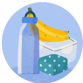
food and drink

On the front of this poster you will find 6 key areas . Each area has between 4 and 6 tips on how you can cut down on waste!