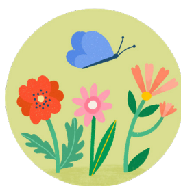
playground and outdoors