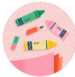
stationery and equipment